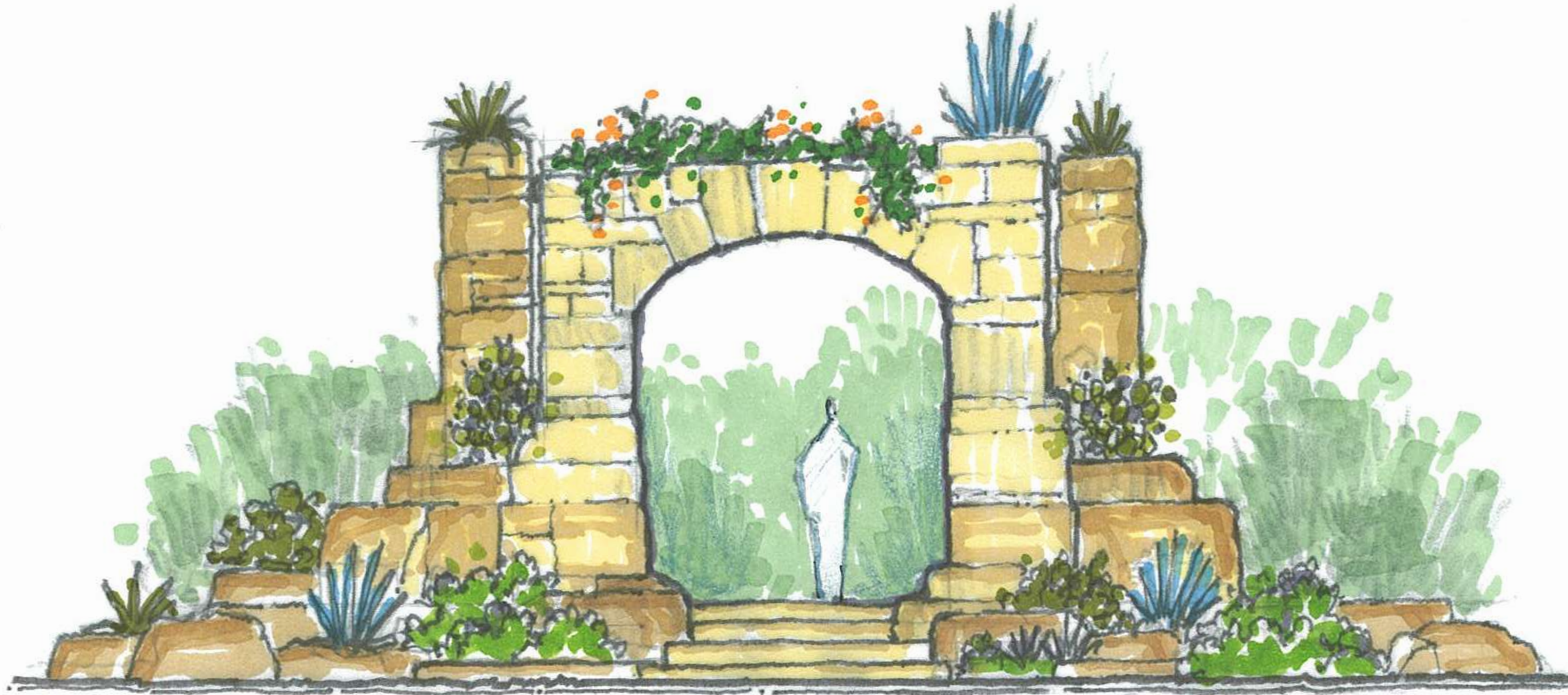
Pergola Concept Sketch