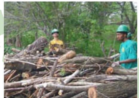
Hard-working Freescale volunteers, American YouthWorks crew members load barge with brush from invasive non-native trees.